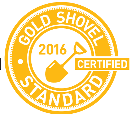
1-color PMS 130C