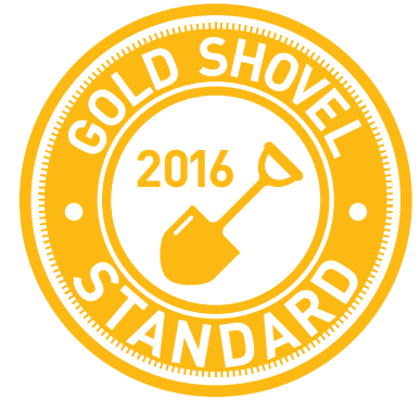
1-color PMS 130C